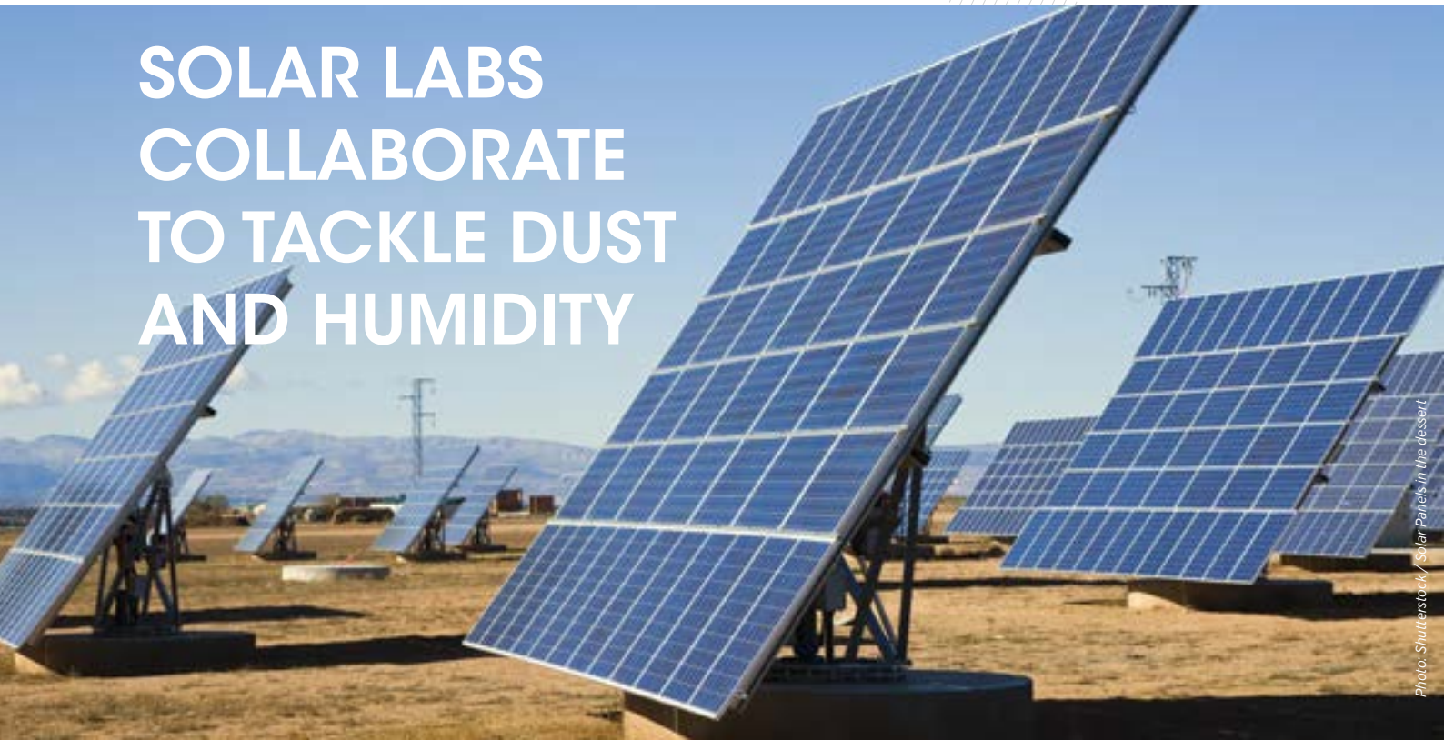
Solar Panels in the desert