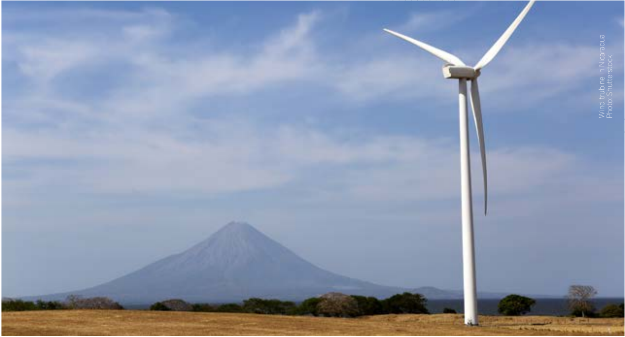
Wind turbine in Nicaragua