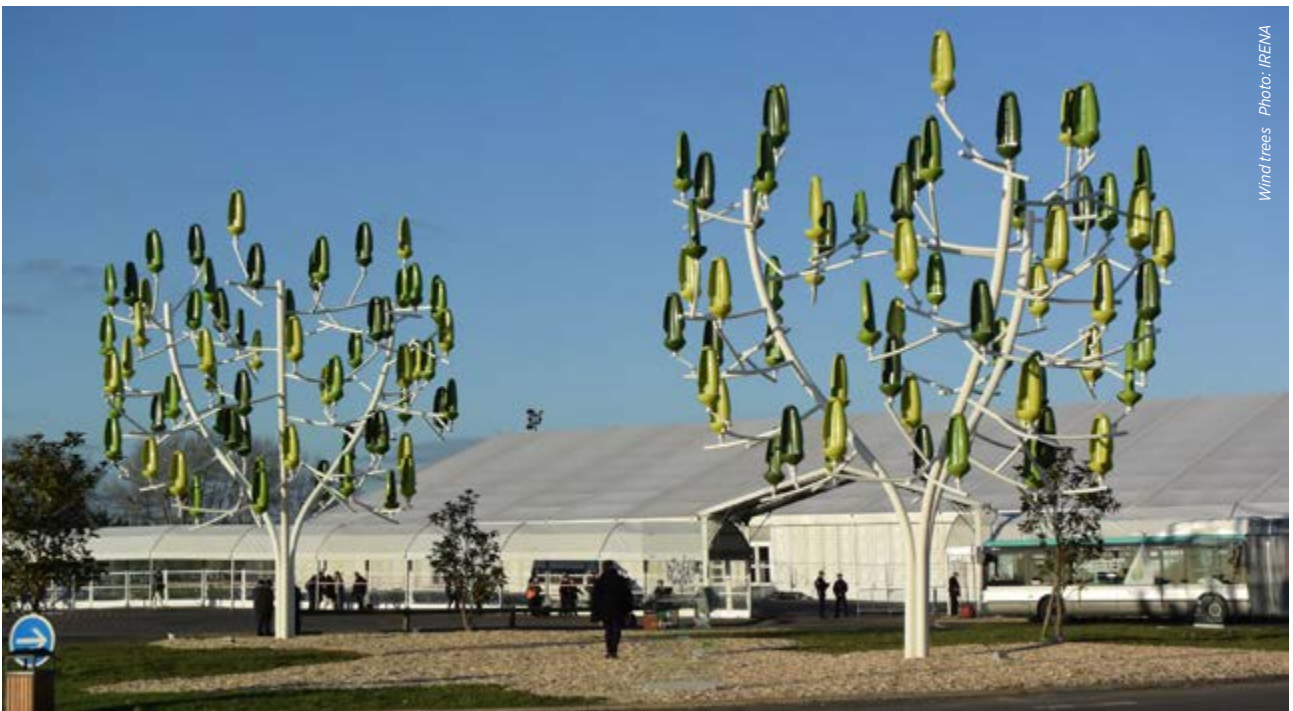
Wind trees

The Ministerial Communiqué is available on the IRENA website.