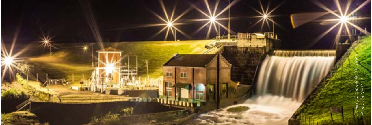
Small hydropower facility, Brazil