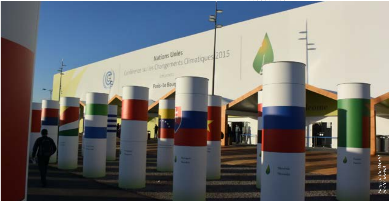
Flags of the World