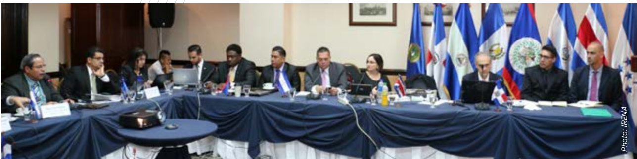
SICA Energy Ministers meet in El Salvador

For more information visit: IRENA-Latin America High-Level Consultation